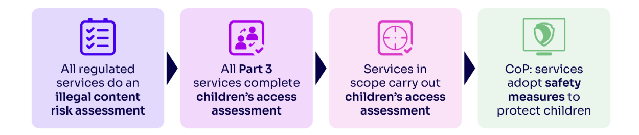
Figure 1: Service providers in scope of the children's risk assessment duty

1.5 Please see further resources and tools on the <u>Ofcom website</u> to help you understand and meet your obligations under the Online Safety Act.