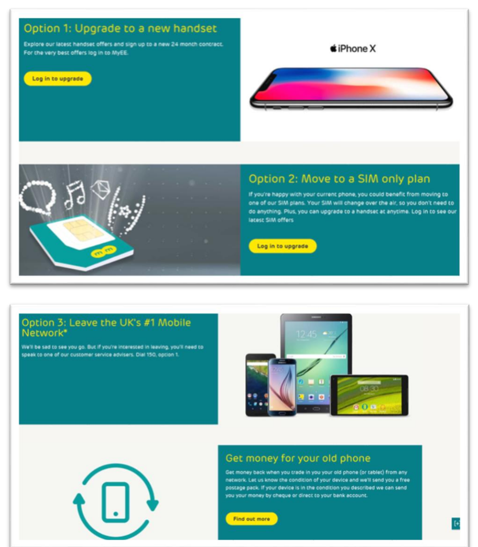
Fig 3: Our static webpage clearly sets out customers options when they come to the end of their contract.