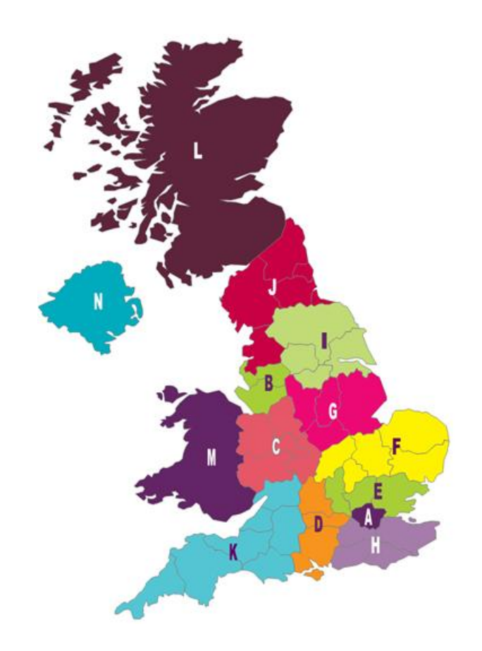
Figure 4 : Geographic Regions

Key: Shaded areas represent the BFWA licences awarded in 2000; Plain areas represent the Spectrum Access licences awarded in 2008