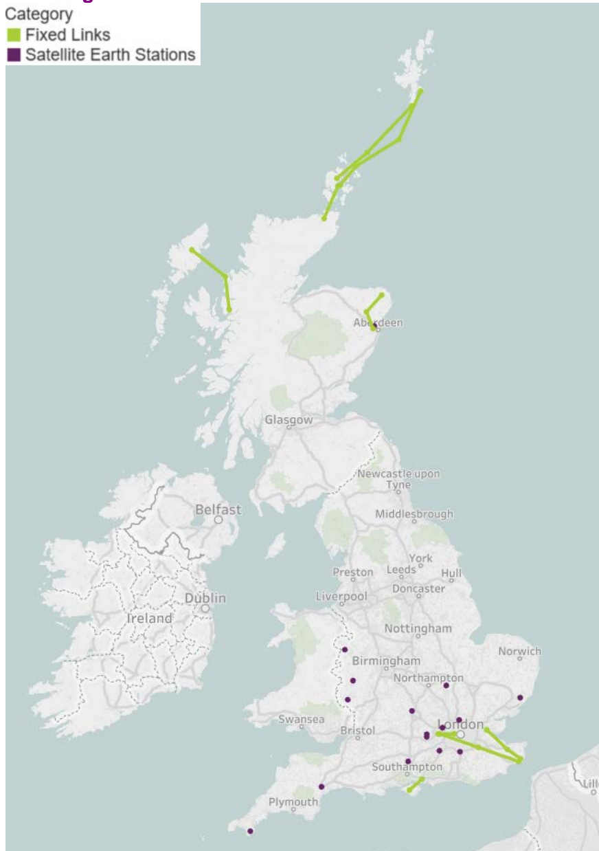
Figure 2: Geographic distribution of fixed links and registered satellite earth stations receiving at 3.6GHz to 3.8GHz 14